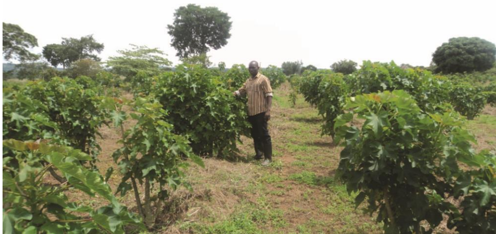
Figure 17: Young Jatropha plantation (a biofuel crop) in Uganda

Biofuel production and utilization is not new in Uganda. Currently, biofuel production and utilization in Uganda is ongoing albeit on a small scale. Studies carried out indicate that biofuel production by the private sector is gaining momentum. Government is encouraging investment in biofuel developments to harness the perceived benefits of biofuels, which include a reduction in greenhouse gas emissions, increased energy security, creation of employment opportunities, increased income for rural households, improved balance of trade through reduced importation of petroleum and enhanced National Economic development.