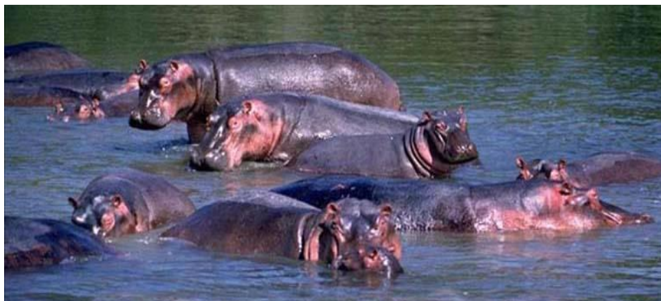
Figure 8: Hippos in River Nile within Murchison Falls National Park