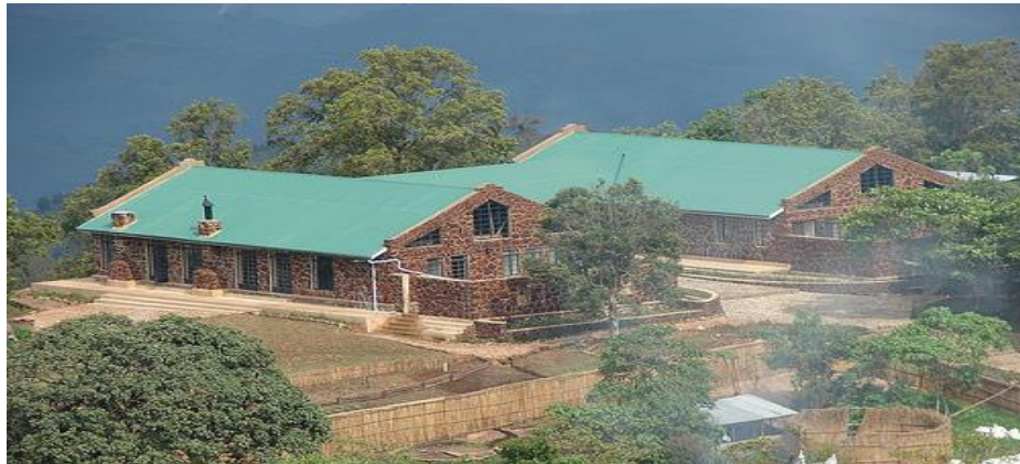
Figure 14: A community lodge in Bwindi National Park.

businesses to operate hotels within the protected areas have also boosted employment opportunities for local people. Hotels within and outside conservation areas employ a number of people from the surrounding areas and contribute to the National Treasury through taxes.