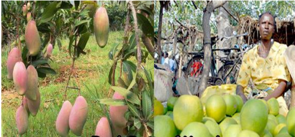
Figure 12: Fresh mangoes in Uganda

Threats to Plant Genetic Resources (PGR) for food and agriculture include the following: