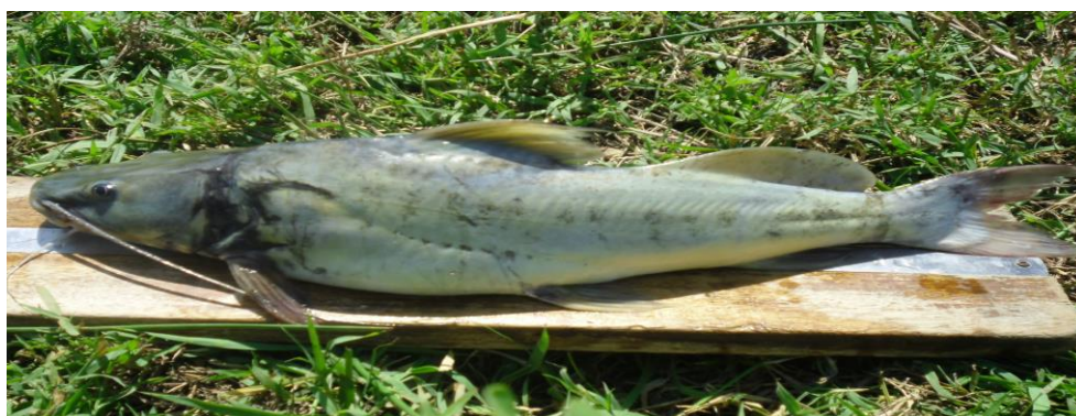
Figure 4: Bagrus documak(Ssemutundu -a delicacy in Uganda) from Lake Bisina

Fishes: The fish biodiversity in Uganda is dominated by the cichlid family consisting of 324 species of which 292 are endemic to Lake Victoria. Of the over 600 fish species found in Uganda, the only commercial fish species include Nile perch ( Lates niloticus ) found in all the major lakes except Edward/George. Other commercially exploited species include the Nile Tilapia ( Oreochromis niloticus ) found in all major water bodies, Mukene ( Rastreneobola argentea ) from Lakes Victoria and Kyoga, Muziri/Mukene, ( Neobola bredoi ) of L. Albert, Catfish ( Clarias gariepinus ) and the Silver catfish ( Bagrus documak ) from all major water bodies. Alestes Baremose , Brycinus nurse and N. bredoi currently constitute about 80% of fish biomass in Lake Albert. The most common fish species to almost all the water bodies is the Lungfish ( Protopterus aethiopicus ).