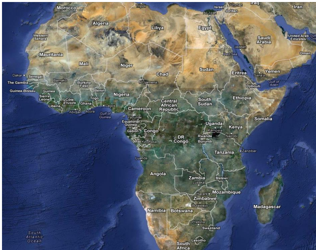
Figure 1: Location of Uganda in Africa

Uganda is a landlocked country that lies astride the equator between 4°N and 1°S and stretches from 29.5°W – 35°W (Figure 1). It is one of the smaller states in Eastern Africa covering an area of 236,000 square km comprising 194,000 square km dry land, 33,926 square km open water and 7,674 square km of permanent swamp (Langdale-Brown et al 1964, Langlands, 1973).