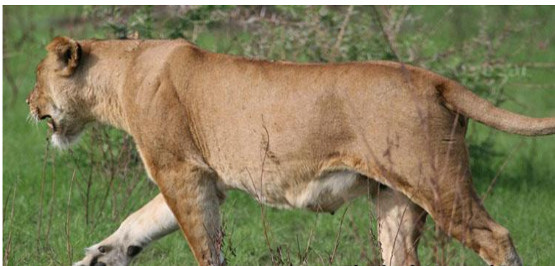
Figure 5: A lion in Queen Elizabeth National Park

Uganda's wildlife conservation areas are very rich in biodiversity. According to UWA (2012), there are 405 species of mammals, 177 species of reptiles, 119 species of amphibians and approximately 1,000 bird species in Uganda's wildlife conservation areas.