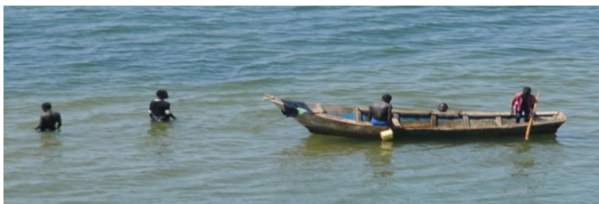
Figure 11: Fishing in Uganda's waters.