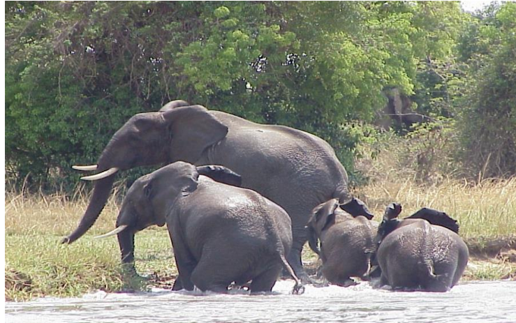
Figure 9: Elephant population in Uganda is slowly increasing