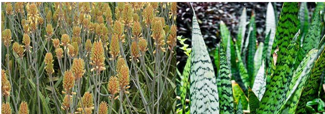
Figure 15: Aloe vera – A medicinal plant

The practice of using herbs dates back to the African traditional societies that entirely depended on biodiversity to satisfy their health needs. This knowledge of plants with herbal value was passed on from one generation to another and is referred to as traditional or Indigenous Knowledge (IK) in the present day. There are various plants associated with medicinal value in Uganda including Moringa, Aloe Vera, Prunus africana , African tulip and African Tonic among others (NEMA 2011). Recent ethno botanical research has identified more than 300 plants (trees, shrubs, flowers and weeds) growing wild across the country associated with medicinal value. Some of these crops have gained value in the pharmaceutical industry and are now grown on a commercial value while others are harvested by herbalists at a zero price.