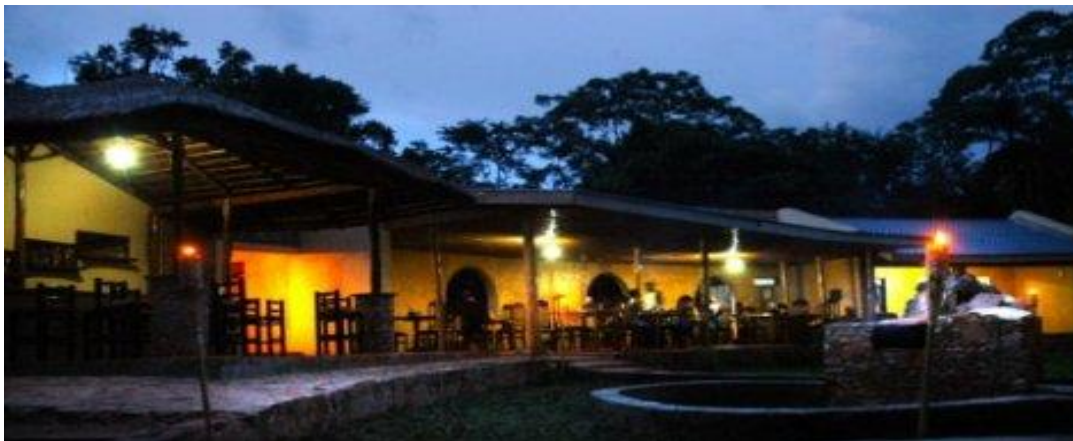
Figure 15: Kibale Primate Lodge

Tourist arrivals rose from 806,658 in 2009 to 1,233,000 in 2013 representing about 17% annual growth rate. Uganda's tourism relies significantly on wildlife and visitors to wildlife protected areas have been steadily growing. Annual visitor arrivals to wildlife protected areas grew at an average annual growth rate of 35% in the last ten years.