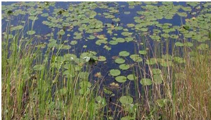
Figure 7: Aquatic biodiversity habitat

Aquatic biodiversity is to a large extent, outside the PA system. It therefore suffers direct human impacts as communities exploit it for their sustenance. For example, fish biodiversity has been adversely affected due to unregulated exploitation without adequate provisions for sustained renewal of the fish. There has also been a considerable change in fish species composition in lakes such as Victoria and Kyoga following the introduction of the Nile perch in the 1950s. Shoreline vegetation, such as papyrus, Vossia and Typha which are under increasing threat form an important habitat for fish biodiversity. Uganda has about 600 fish species in terms of biodiversity and all edible but the commonly encountered in trade are dominated by the Nile perch, Nile tilapia and small fishes (mukene, ragoogi and nkejje).