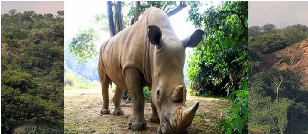
Figure 10: A Rhino at Uganda Wildlife Conservation Education Centre

It should be noted that before the civil strife in the 1970's and 1980's, Uganda had both the northern white rhinos ( Ceratotherium simum cottoni ) and eastern black rhinos. All these rhinos got extinct in the 1980s and we currently have none of the original indigenous rhinos. What we now have is the Southern white rhino ( Ceratotherium simum simum ) which is just an out of range sub-species (new introduction) in Uganda. Six of them were got from Kenya and 2 from United States of America. Their population now stands at 14 individuals in the country.