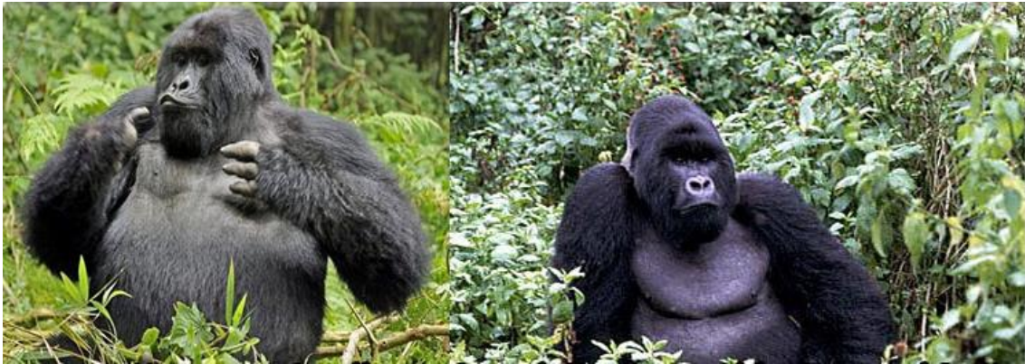
Figure 2: Mountain Gorillas in Bwindi Impenetrable National Park

including charismatic species of Mountain Gorillas and Chimpanzees, and more than 5,406 species of plants so far recorded of which 30 species of plants are endemic to Uganda (MPS, 2013/2014).