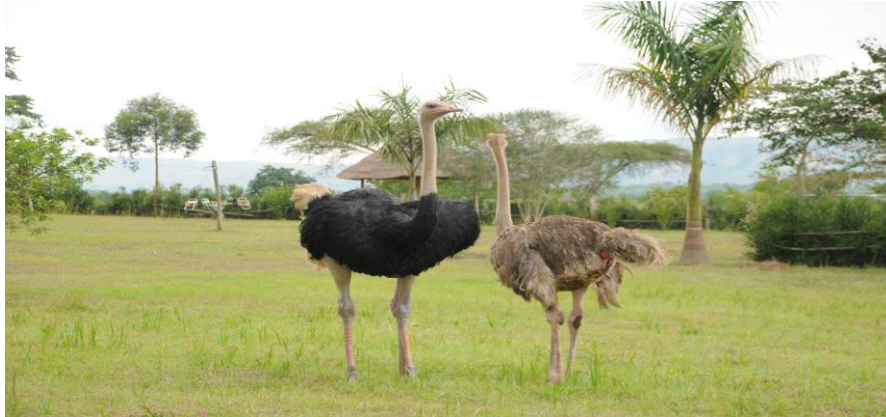
Figure 3: Ostriches in Kidepo National Park

Birds: Uganda has approximately 1,016 species of birds (10% of world total). There are over 2,250 species recorded on the African continent and the total list of Uganda species represents nearly half (47%) of all species recorded on the continent. There are 143 palaeartic migrants, 56 afro-tropical migrants and 25 Albertine endemics. A total of 189 species are forest specialists while 160 species are water dependent (Byaruhanga et al, 2001; NBI, 2010).