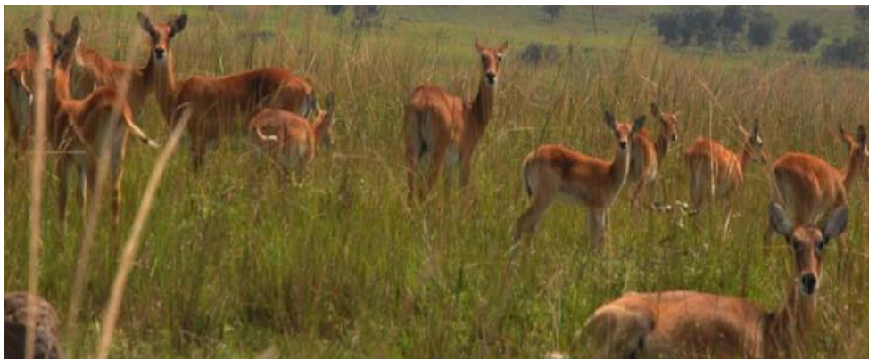
Figure 6: Uganda Kobs in the Savanna Ecosystem of Queen Elizabeth National Park

Biodiversity in savannah ecosystems: Grasslands/savannas cover more than 50% of the land area of Uganda and are dominated in different locations by species of grasses, palms or acacias. A diversity of other plant and animal species are also closely associated with various natural savanna types. Much of this habitat has been converted to human use for agriculture and grazing. The remaining pockets of natural savannas and grasslands are primarily found in various protected areas in Uganda.