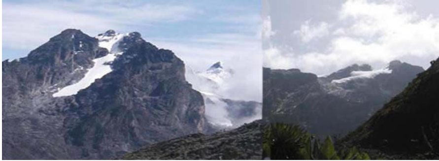
Figure 16: The legendary Mountains of the Noon in Rwenzori National Park.

Impacts of climate change on biodiversity have already been observed in some areas. As a result of global warming the ice caps on the Rwenzori ranges (the legendary mountains of the moon) have largely melted, leading to increased volumes of water in the Semliki River. This has led to erosion, siltation and shifting of the course of the river, which all lead to habitat disturbance, as reported in the Uganda National Adaptation Programmes of Action report (MWE, 2007). Species reported to be affected include the Mountain Gorilla, alpine and sub-alpine species on the Rwenzoris such as the Giant Lobelia, Tree Senecio, the Rwenzori Leopard and the Rwenzori Red Duiker. The Three-horned Chameleon and Senecio are reported to have already shifted their ranges upwards due to warmer temperatures.